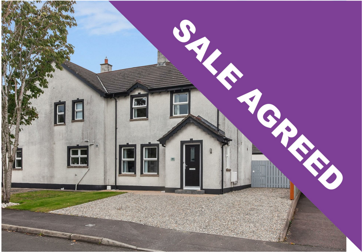
80 Huntingdale Green, Ballyclare, BT39 9FL